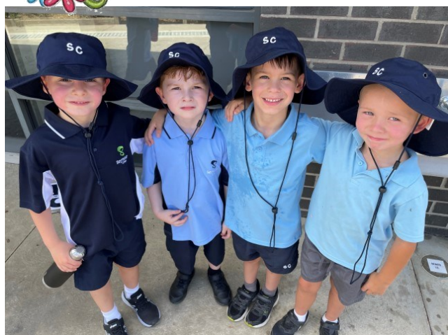
ABOVE: Four of our Foundation students in their new hats, kindly supplied by the Parents and Friends Association.

The Seymour College Parents & Friends Committee would like to sincerely thank everyone who contributed towards our 2021 Christmas Fundraiser. Your generous contributions are very much appreciated and valued in our efforts to raise funds for important projects which help our students college wide.